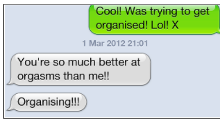
Figure 1: Example of unintentionally funny autocompletion from a sms conversation.

phrase, before it is completely typed. The procedure is based on the selection of the most probable word in a limited set of possible completions. Autocompletion was originally employed in accessibility tools and mobile phone devices with limited keyboards (Garay-Vitoria and Abascal 2006). The text prediction task consists of editing text with the minimum number of keystroke possible. Perhaps the best known example is the T9 patented technology, widely employed in most of the older generation of mobile telephone devices (Grover, King, and Kushler 1998). A particular type of autocompletion, called semantic autocompletion , was proposed for applications in information retrieval (Hyvönen and Mäkelä 2006). It integrates semantic information in the text prediction process. For example, it could show the completed text as part of a hierarchy of concepts.