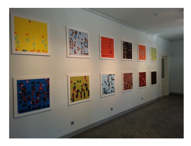
Figure 2: Image from the exhibition in Tartu, Estonia

During the exhibition in Helsinki we collected feedback from the audience. Beside the artworks, we placed feedback forms and a box for slipping them in. In order to make giving feedback easy, the feedback form contained two questions: