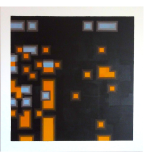
Figure 1: A process visualization image generated by the computer (left) and a photograph of the corresponding acrylic painting (right). For the respective poem, see the text.