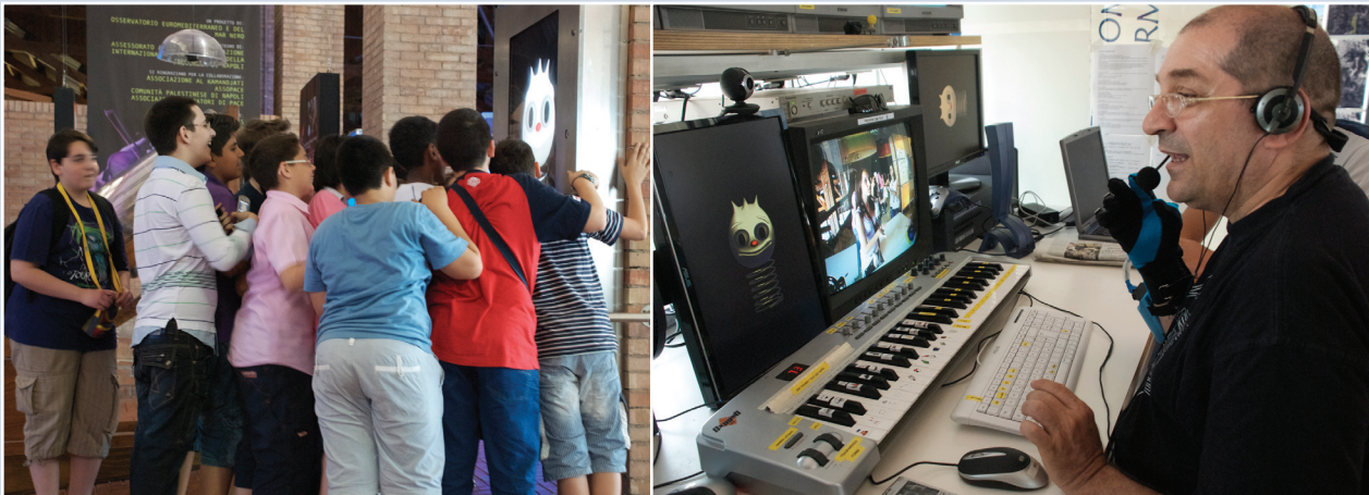
Pupils interact with the virtual puppet display while a puppeteer controls the puppet using multimodal interfaces at the hidden station.

keyboards, and a mouse to operate puppets at five museum stations. The puppeteer at a control system sees what the puppet sees through a camera and microphone at each station and can rapidly switch between stations and choose to interact with passersby.