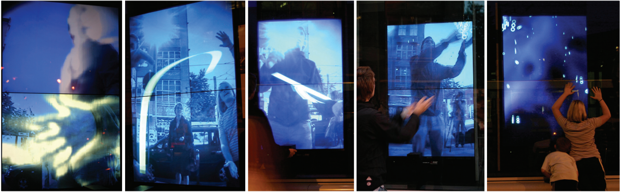
From left to right: hand motion creates an aura; a flexible band (next two photos); and luminescent numbers (last two photos).

audience movement. Users could observe the gesture-based interaction of others or be an audience to their own gesturing image. The degree of interaction depended on age and role. For example, children were highly interactive, playing freely, while policemen tended to avoid interaction.