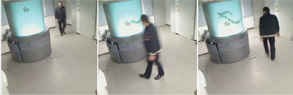
A passerby discovers the column and explores it from several positions. Unlike a flat display, all vantage points are equally important. Because it isn't necessary to occupy the center-front position to get the display's full value, more people can join in the viewing.

Furthermore, a flat screen has a single preferred standing position in the center front. Possession of this position identifies a single main user or performer. In contrast, all the positions around a cylindrical display are equal, making it easier for others to join the performance.