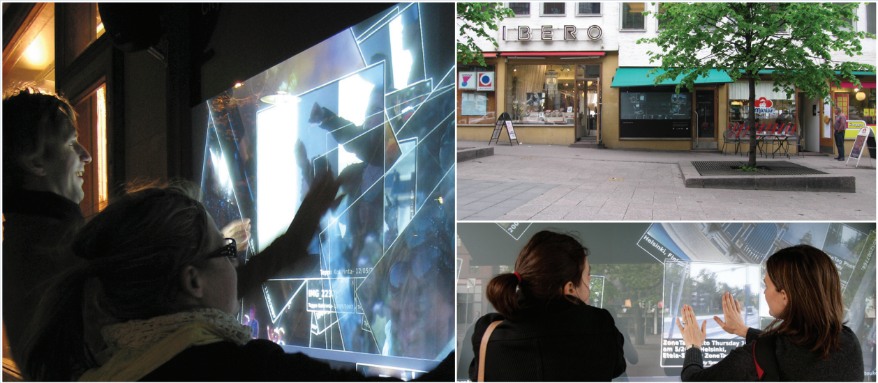
Clockwise from left: passersby play with images on the CityWall timeline; the display from a street view; and two users share comments on pictures of Helsinki.

ing an architectural element into the space as a new construct. CityWall effectively transforms an architectural object into an interaction of space and events. In the window, it is, of course, highly visible, yet it also changes how people use that space. For example, passersby initially grouped around CityWall's shop window to seek shelter from the rain, but then started using the space in front of the display to engage in playful and social media explorations.