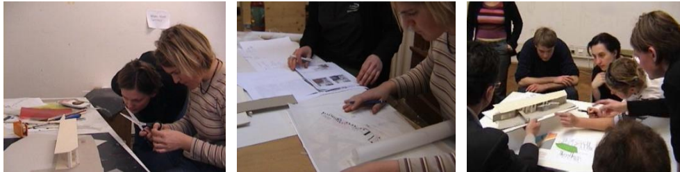
Figure 2: Switching between design representations

As an example two students worked on a façade for ‚Möbel L’ (a furniture house who sponsored a student project for their main inner city building). The students envisioned the façade of the building as a threshold between inside and outside. On their table are sketches of the form of the façade, detailed plans, drawings visualizing atmospheres and situations of use, 3D models, diagrams - a collage of visual and tactile material (Figure 1). One reason for this diversity of representations is that changing media and scale adds to the quality of the design process, with different techniques allowing to explore different aspects of the design idea. These heterogeneous representations are often manipulated simultaneously and they evolve in different versions. While working the students continuously switch between representations, as for example in Figure 2 where they work on a 3D model of the concept (left), on drawing and sketches (middle) or with the 3D model and diagrams in parallel (right).