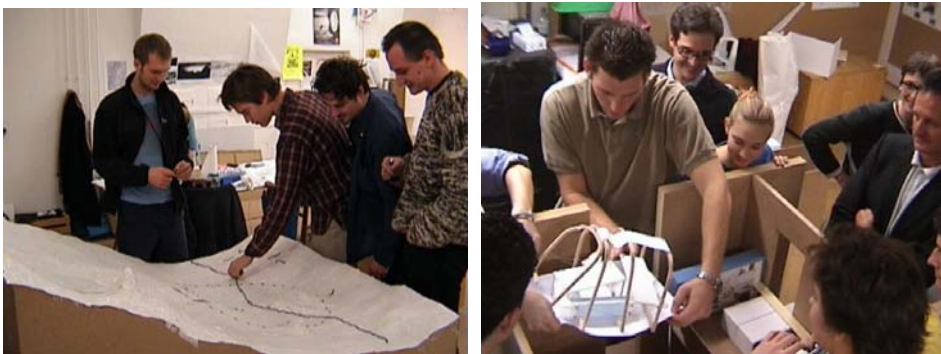
Figure 6: a shared model b) Placing elements in the shared model to demonstrate their relationship to the environment.

Artefacts such as large scale models are sometimes shared. They offer a platform for group discussions. This was the case in the project ‘Learning from Tibet’ where a series of interventions into an alpine environment was held together by a large plaster model which served as a point of reference for discussions, with students placing material such as threads or tape to mark forms of paths, and rivers on it. Each time we visited the project space we found new traces of students’ discussions (Figure 6 a).