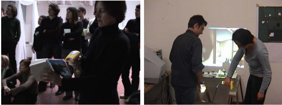
Figure 12: a) Barcodes on the pages of a diary of a visit; b) on parts of a model

Touch sensors and sensitive samples: We are experimenting with various types of sensors to augment physical objects. For example, sensors have been installed inside a wooden box that recognize actions such as shaking, knocking, and stroking, with different actions activating different types of material – sound, images, video, and wind (Figure 13a). The “book that speaks” is equipped with a sensor that, when the book is picked up, activates instructions how to read the diary using the barcode scanner (Figure 13b).