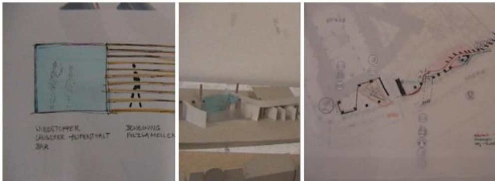
Figure 1: A diversity of design representations

Students' project work proceeds through developing a large number of design representations. These are characterized by the expressive use of a diversity of materials and are sometimes animated and presented dynamically.