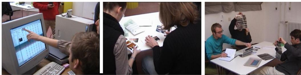
Figure 7: a) Browsing pictures on a PC, b) browsing printed photographs, c) browsing slides

The PC also diminishes the presence of important aspects of work, hiding the work of some students to others. Figure 7a shows two students browsing pictures of a trip on a PC. Due to the particular position of the PC and the fact that the object of work (the pictures) is only accessible on the computer screen, this activity remains separated from what others in the room are doing. Moreover, when the computer is switched off, no traces of students' work are left. In contrast, browsing through printed photographs or slides on the table (Figure 7b and c) creates the kind of visibility that allows others to participate, directly or by being peripherally aware.