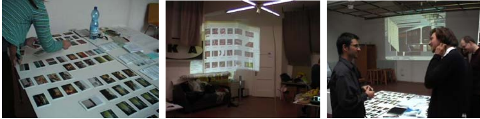
Figure 8: Making work visible a) on the table, b) and c) by projecting work on the PC onto the walls

played sound from a football stadium in Mexico. These interventions completely changed the atmosphere in the project space, evoking some of the common aspects of students' work.