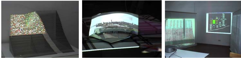
Figure 11: Painting a) spectators , b) a background onto models of a stadium, c) interventions into a space between two buildings.

textures, images or video, scaling and rotating them. Students started animating their models with the help of the texture painter . One student studied soccer games to identify the most exciting camera views and to understand which kind of atmosphere the players need. He used the camera views to find out where to place few spectators so that the stadium looks jammed. He built a simple model of a stadium and used model and images together with the texture painter for projecting different atmospheres into this ‘fragmented stadium’ (Figure 11a and b). Another student painted images of his interventions onto projected images of two residential buildings, projecting detailed plans onto the space between them.