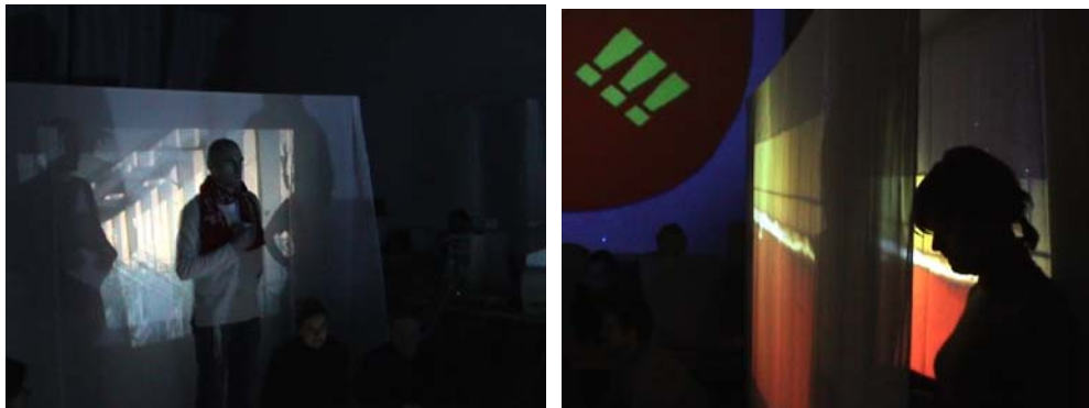
Figure 10: a) and b) Creating an immersive environment with multiple projections,

We observed how a student group configured the workspace for a multi-media presentation, fixing a data projector for floor projections high up on the ceiling and hanging up double layers of translucent cloth. In their presentation the students created a very effective immersive environment, which worked really well with contrasting images of different qualities – sharp and blurred, narrative and symbolic (Figure 10a and b).