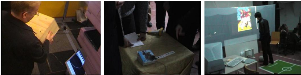
Figure 13: a) Box with sensors inside, b) sensors on a diary c) Sensors connect a moving object (ball) with images and sound

Touch sensors and sensitive samples: We are experimenting with various types of sensors to augment physical objects. For example, sensors have been installed inside a wooden box that recognize actions such as shaking, knocking, and stroking, with different actions activating different types of material – sound, images, video, and wind (Figure 13a). The “book that speaks” is equipped with a sensor that, when the book is picked up, activates instructions how to read the diary using the barcode scanner (Figure 13b).