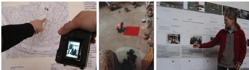
Figure 4: a) Digital pictures and recorded audio around a diagram, b&c) Multiple traveling - the picture of an event and its re-viewing in the context of a presentation

Students' learning happens in different places and in different cooperative arrangements. It is typically distributed in space and time. Activities take place in an environment, which is rich of interactions between students and with the teaching staff and external professionals. Students work individually or in small teams. Sharing a room with other project teams facilitates a 'ping-pong' of ideas, the exchange of knowledge and experiences across teams. They work at different times of the day, sometimes staying over night.