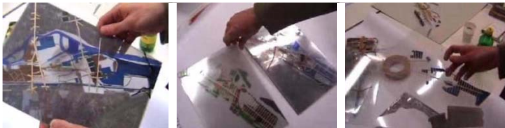
Figure 3: Layers grouped together support different perceptions of a complex design problem

The students’ common field of work is constituted through this diversity of design artefacts and their relationships. These relationships are not fixed, they evolve over time, such as for example the notion of a façade ‘to lean and sit on’ (Figure 1d), which became stable – incorporated into their final drawings - only towards the end of the project. A crucial aspect of the design process is to maintain evidence of all the material that has been produced. It is essential to be able to read and re-read the material from different points of view and to be able to go back to a moment when a particular issue emerged.