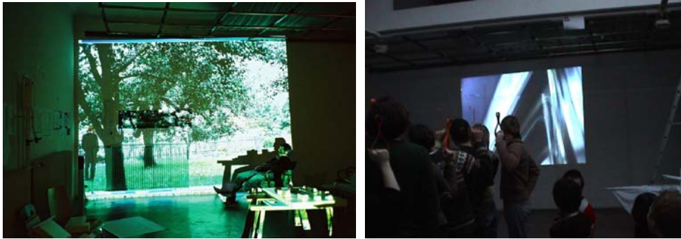
Figure 9: a) life size projections b) multiple traveling

We observed how a student group configured the workspace for a multi-media presentation, fixing a data projector for floor projections high up on the ceiling and hanging up double layers of translucent cloth. In their presentation the students created a very effective immersive environment, which worked really well with contrasting images of different qualities – sharp and blurred, narrative and symbolic (Figure 10a and b).