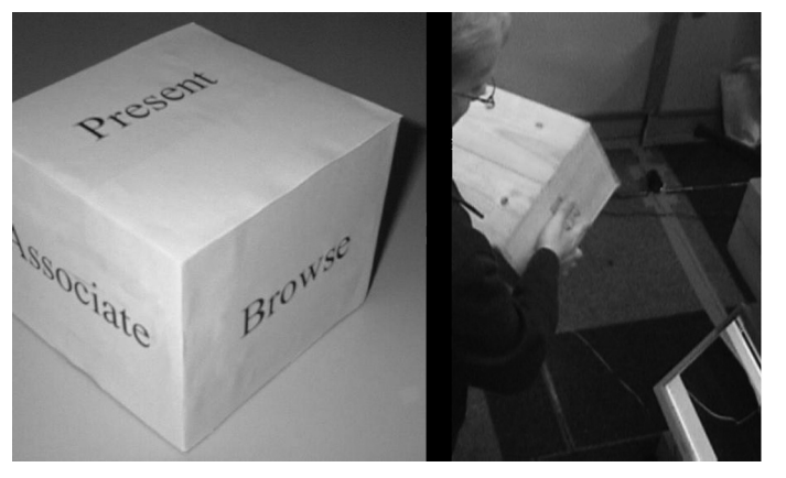
Figure 3. The original prototype proposed to students.

2.2 Staging use in trials as co-development We organised a two-month trial to test some of the prototype components of the environment. We provided students with a room, and 'open' prototypes and help to extend them and integrate them in their projects. The prototypes we provided were open to reinterpretation by participants and could be tailored with our help. We provided barcodes and scanners, RFID tags, and touch sensors. Using physical interfaces such as sensors, tags, barcodes, and projection set-ups, students configured the space to create interactive installations.