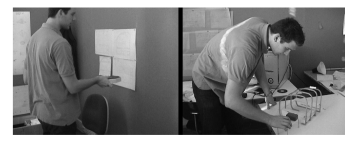
Figure 2. Using mockups as interesting situations arise.

Episode 3: movable parts in models Paul attached the sensor box to a part of his model and envisioned that movement of the parts could be recorded as particular animation of the model that could be played with the virtual model he made, or trigger actions by the system. (This was not implemented). Episode 4: browsing media with gestures Paul connects pictures to barcodes without using the desktop PC. The sensor box is used to browse pictures with gestures. The pictures are displayed on the wall or on the pocket PC (This was implemented).