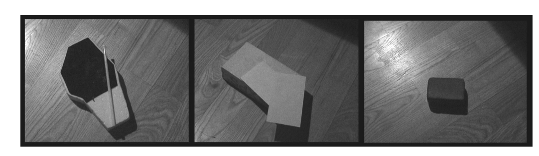
Figure 1. Mock-ups: (left) pocket PC, (centre) magnetic tag reader, (right) small sensor box.