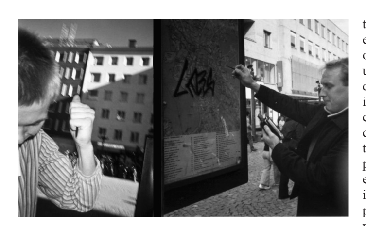
Figure 6: (left) A frustrated user .(right) A user puzzled with the positioning system.

CP: You look awfully angry . User makes a face at the device.