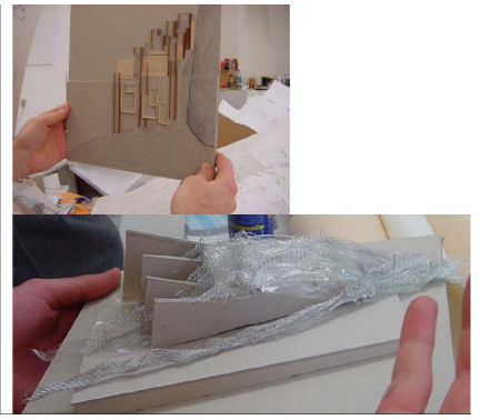
Figure 2. Different representations of the same design Narrative, persuasive aspects of material features.