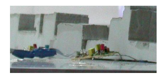
Figure 3. Equipping models with touch sensors

analyze materiality. They look at text as material objects with distinct physical features and investigate how children choose from a range of semiotic systems (written sentences, maps, diagrams, pictures) and materials (surfaces, substances, tools) for conveying meaning; how they discover how physical and visual techniques can be made to represent more abstract kinds of information, such as for example atmosphere, emotions; how they assemble layers of different kinds of material into extremely complex, multi-textured spatial environments. While some physical and visual techniques can be made to represent more abstract kinds of information, such as vibrancy, fragility or motion [22], others are more directly representational of what a building will actually look like.