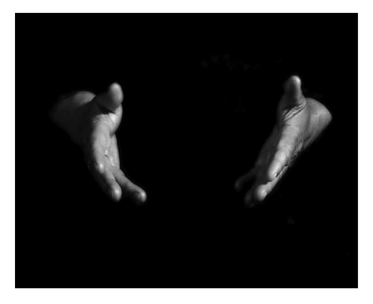
Figure 4. Hands open towards the participant when stroked.