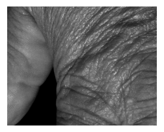
Figure 5. Close-up of the hand.

The participative filming process took place in summer 2010. People living in Helsinki, including many Romani residents, were filmed. The filmed materials constituted a moving image archive which aimed at making visible the diversity of people and their lived experience in the city. People were asked to perform in front of the camera and imagine how they feel in their bodies when waiting for something. Often the camera was just left running to capture whatever affective motion the hands would perform.