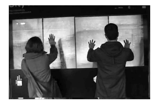
Figure 6. Students acting and interacting with the installation to attract people.

Students also made use of objects such as props, effectively staging different affordances and giving clues about the interactivity of the work. This also worked for forging boundaries around the installation. For example, one group utilised a chain which was found in the site environment. Students tried to attract attention by narrowing the walkway