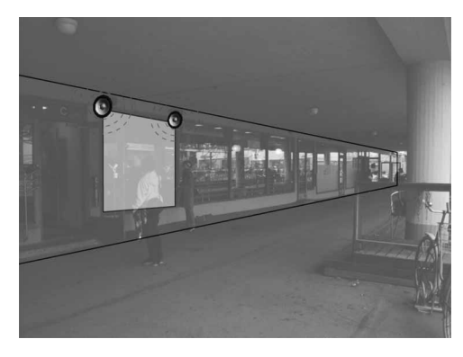
Figure 12. Using sound on site can also alter the experience of the space and it may trigger people's curiosity.

examples of how the installation setting can be improved in an outstanding and visible way.