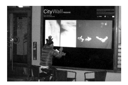
Figure 8. Making use of objects for scene creation to catch people's attention.

Acting, interacting and creating new spaces and situations in the At Hand installation were carried out by theatrical approaches. The stage was built through the manipulation of objects; they were devices imposing constraints and opportunities for attacting more people, facilitating participation and changing the experience of