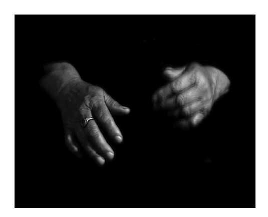
Figure 2. Hands on screen, first performing idle gestures.

The final At Hand narrative can be divided into four events. First, there are the anonymous hands, performing being-in-waiting as patterns of small gestures (Figure 2). Second, when the system becomes aware of the presence of the spectator, the pattern of the hand movements will change to communicate that awareness back to the subject, who has now become a participant in the narrative (Figure 3). Third, when the participant strokes the image of the hands on the multitouch screen, the hands will open gradually and reveal a close-up image of a small section of the hand (Figure 4). Fourth, the participant is able to explore the details of the hand by stroking the image (Figure 5).