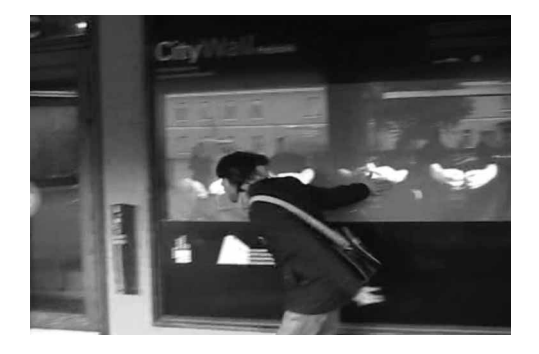
Figure 7. Students acting and interacting with the installation to attract people.

and thus altering the circulation of people in the space. However, they realised that the use of the chain could have been intimidating to people because it can be regarded as aggressive material. On the other hand, the group wanted to create a high-impact change within the architectural environment. On the same lines, another group borrowed chairs from a nearby bar to create a scene in front of the At Hand installation. This was an attempt to catch people's attention by interacting with the chairs and by appropriating the installation space (Figure 8).