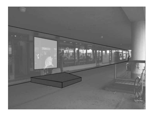
Figure 10. Suggestion for a visible setting at the At Hand installation.