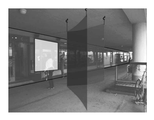
Figure 9. Suggestion for a visible setting at the At Hand installation.

Other ideas on the visibility of the At Hand installation were also conceived and drawn. Figures 9, 10, 11 and 12 are images created by the students in which they suggest various