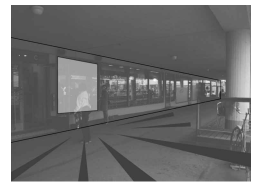
Figure 11. Suggestion for a visible setting at the At Hand installation.