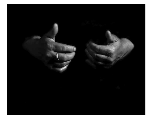
Figure 3. Hands then becoming aware of the spectator.

The final At Hand narrative can be divided into four events. First, there are the anonymous hands, performing being-in-waiting as patterns of small gestures (Figure 2). Second, when the system becomes aware of the presence of the spectator, the pattern of the hand movements will change to communicate that awareness back to the subject, who has now become a participant in the narrative (Figure 3). Third, when the participant strokes the image of the hands on the multitouch screen, the hands will open gradually and reveal a close-up image of a small section of the hand (Figure 4). Fourth, the participant is able to explore the details of the hand by stroking the image (Figure 5).