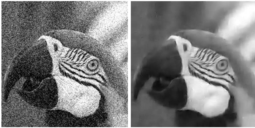
Figure 2: An experiment in image denoising. A noisy image, depicted on the left, was denoised by sparse code shrinkage to obtain the image on the right.