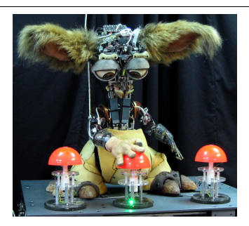
Figure 1. Leonardo performs the steps as he learns them providing the human tutor with valuable error-correcting insight in real time.

Bratman also defines certain prerequisites for an activity to be considered shared and cooperative: he stresses the importance of mutual responsiveness, commitment to the joint activity and commitment to mutual support . Cohen et al. support these guidelines and provide the notion of joint stepwise execution [5, 18]. Their theory also predicts that an efficient and robust collaboration scheme in a changing environment commands an open channel of communication . Sharing information through communication acts is critical given that each teammate often has only partial knowl-