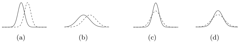
Fig. 1. The absolute change in the mean of the Gaussian in figures (a) and (b) and the absolute change in the variance of the Gaussian in figures (c) and (d) is the same. However, the relative effect is much larger when the variance is small as in figures (a) and (c) compared to the case when the variance is high as in figures (b) and (d) [12].